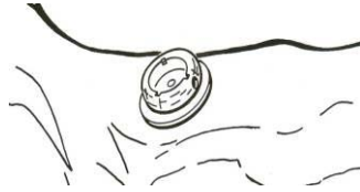
Block-Out Spacer (No. 8514) Fig 3

acrylic resin from locking the denture onto the abutment. This can be accomplished by stacking more Block-Out Spacers.