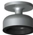
Aluminum housing W/black LDPE Male