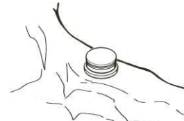
Denture Cap Processing Male Assembly Fig 4