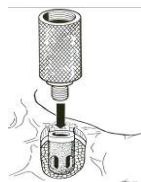
Abutment Driver LOCATOR Core Tool (8393) Fig 1